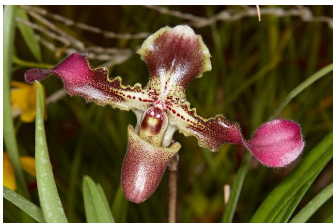
Paph. hirsutissimum "Ethan"- Allan Castillo