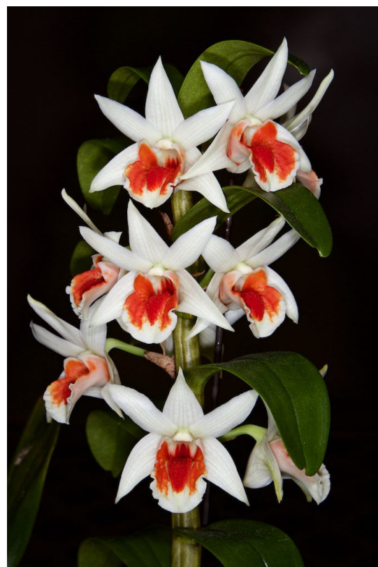
Dendrobium Green Lantern-Deb Amis